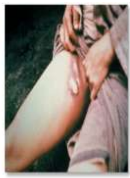
Fig:1. Axillary and inguinal buboes in patients with bubonic plague.

The bacteria deposited from the flea bite migrate rapidly to a regional lymph node and multiply during an incubation period of 2-6 days.<sup>25</sup> Alongside the onset of sudden fever and a recognizable and extremely painful bubo<sup>3</sup> appears from the significant bacterial proliferation and inflammation, in as early as up to one day. 11 Within the lymph node they are phagocytosed but evade destruction, and subsequently cause necrosis of the lymph node architecture. 11 The bubo most typically develops in the inguinal region but can also be distributed anywhere there is a lymph node in the body, commonly in the cervical and axillary regions<sup>11</sup> (Fig. 1). Often the buboes are so painful they completely restrict movement of the affected limb, and range between 1–10 cm in diameter.