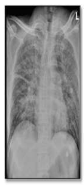
Fig. 3. Chest radiographs of two patients with pneumonic plague.